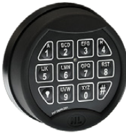
Premier II PI80•Nx