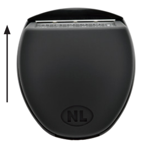
Increase your sales with Corporate Customization!