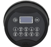
Premier Vision TE20•xx