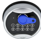
Premier Dallas P180•xx